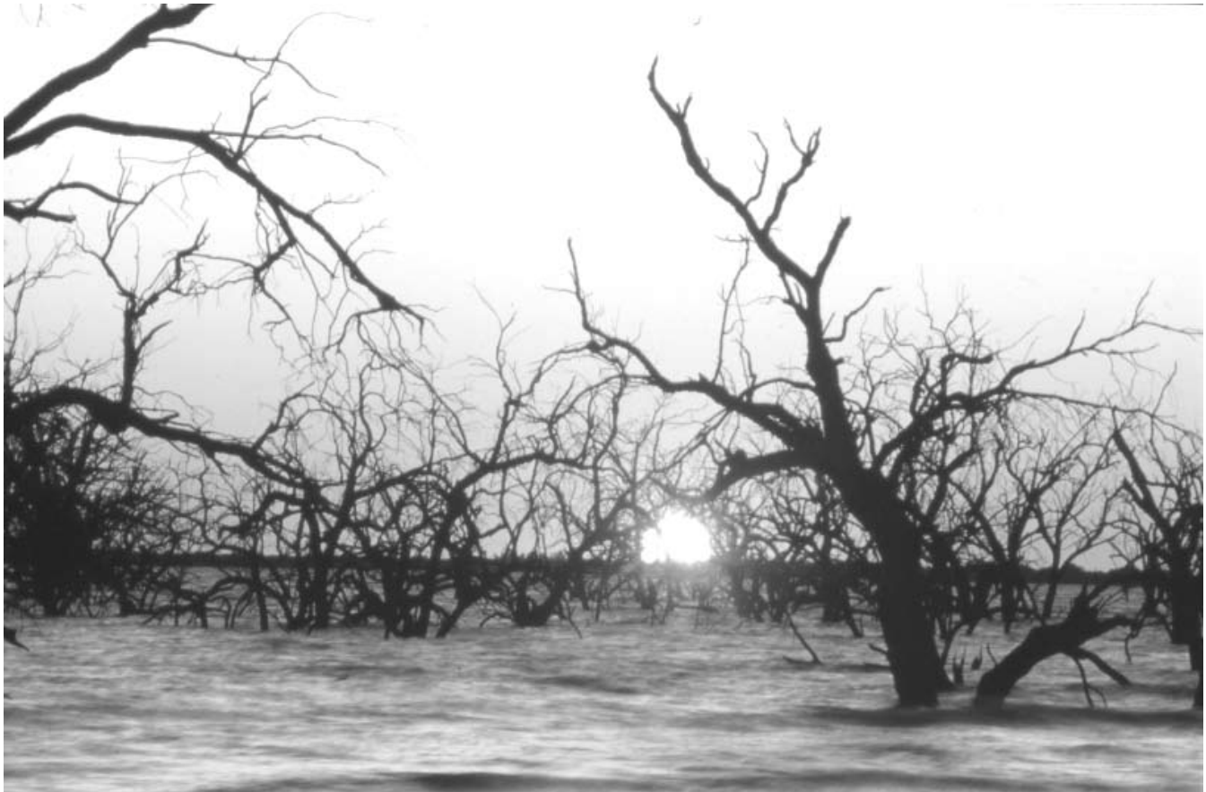
Water was the main agent of destruction for the Flood

ground cavities rather than relatively small terrestrial springs. Although the latter may explain the removal of all land creatures quickly, it is not consistent with the straightforward understanding of Gen. 7:17–24, which speaks of the waters prevailing (7:18), and then prevailing exceedingly (7:19) for 150 days (7:24). However, this prevailing is entirely consistent with subterranean fountains issuing water to the oceans with, no doubt, tsunami of continental proportions criss-crossing the globe and leading to gigantic tidal waves on reaching the shorelines of any exposed land.