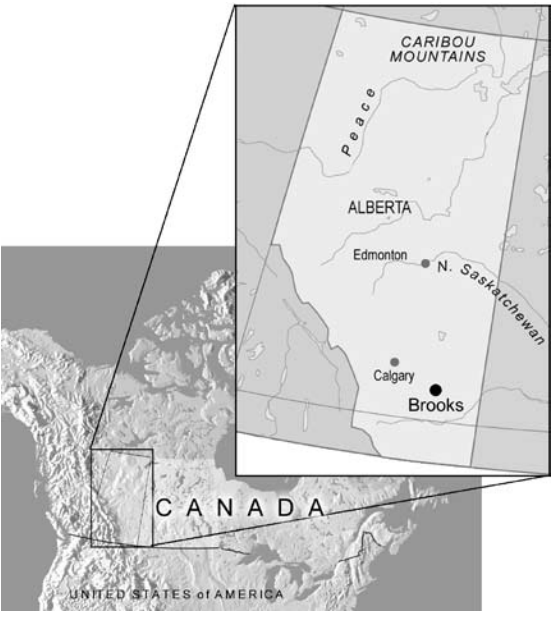
Figure 1. One large Centrosaurus bone bed, called BB43, is located along the Red Deer River of Dinosaur Provincial Park, about 50 km north of Brooks, Alberta.

'The data presented in this study support a catastrophic death for the original Centrosaurus assemblage ... a catastrophic death by drowning for the centrosaurs preserved in BB