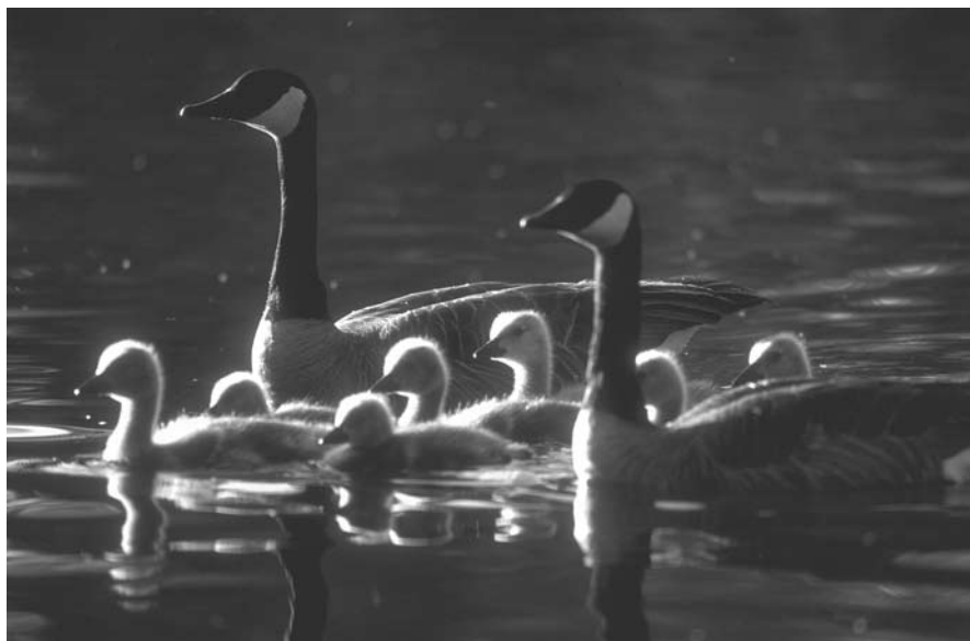
Canada Goose family. The reproductive rate of a species is a major factor limiting the rate of trait substitution.