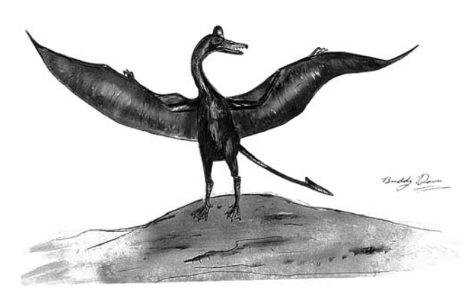
Figure 2. Flying reptiles, i.e. pterosaurs, are known to have had pneumatization in some of their bones similar to that of birds. However, this does not make them avian ancestors, and even evolutionists believe that this is simply a design function for lightening the bones.

In short, this discovery does not show that dinosaurs evolved into birds and it does not even necessarily imply that dinosaurs had an avian lung despite the 'dinos breathed like birds' hype. If it should turn out (via some remarkable soft-tissue preservation) that they did, it would certainly