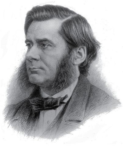
Figure 1. Thomas Henry Huxley in 1874.

sediment as embedded tiny granules. These granules appeared to move when examined under a microscope. As a result he thought he had found the original protoplasm of life in the gelatinous ooze. Protoplasm was at the time believed to be an organic substance that formed the basis of life, and therefore something of this nature, found in ocean sediment, suited the evolutionary speculation of the period (see figure 2). Haeckel had recently proposed that such an entity existed as the precursor of life, and Huxley rather excitedly wrote to Haeckel in October 1868 the following comments offering to name the new 'Moner' after him.