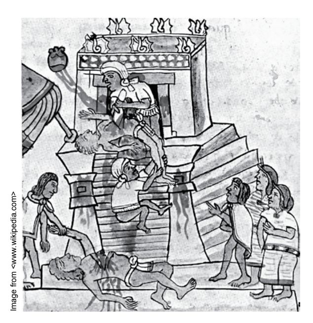
Figure 1. The Aztecs and other societies that adopted temple religions routinely practiced human sacrifice in order to appease their god.

cultural/religious values and practices, but as a direct result of failing to live by those values and practices! A person born into poverty will remain in that state for life. No Hindu will seek to help them or improve their state because this would go against one of their fundamental beliefs: the doctrine of karma