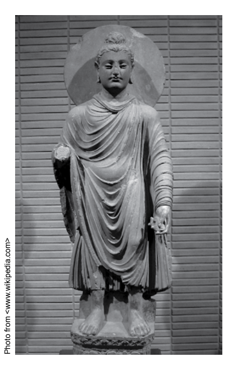
Figure 3. Gandhara Buddha. 1<sup>st</sup>–2<sup>nd</sup> century AD. Bhuddists seek Nirvana—the state of enlightenment—through suffering and self-denial.

Not only are such remarks indicative of chronological snobbery, they are theological nonsense. From the very beginning, the punishment for sin has been death (Gen. 2:17). Christ's sacrificial death is also the subject of many prophecies (e.g. Gen. 22:1–14; Isa. 53) and the only way to gain forgiveness for sins is through the shedding of blood (Heb. 9:22). This is why Christ had to die on a cross as a blood sacrifice for our sins.