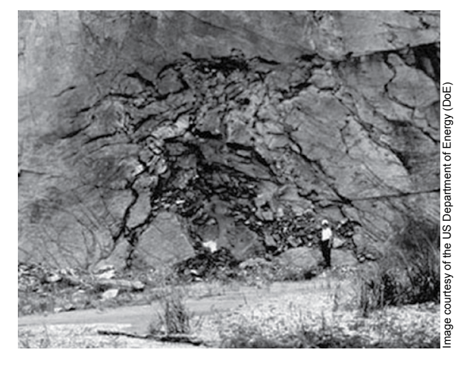
Figure 2. One of the uranium concentrations at Oklo.

Whether self-sustaining nuclear reactions are possible is dependent on several factors, including the leakage rate of neutrons from the reactor and the possible presence of so-called poisons. The presence of small amounts of boron or vanadium in the Oklo ore would have absorbed neutrons and thus served to prevent the chain reactions from ever occurring. Steve Lamoreaux and his Los Alamos colleague Justin Torgerson reported that the Oklo data are consistent with a slightly different value of the fine structure constant than today's value.8,9 However, the amount they specified