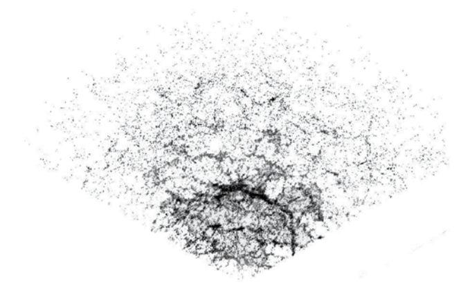
Figure 1. Sloan Digital Sky Survey (SDSS) map, each point showing the position of galaxies with respect to Earth at the apex. Their distances were determined from their spectra to create a 2 billion light-year-deep 3D map where each galaxy is shown as a single point. This is one half of the published map; the whole map shows 66,976 galaxies that lie near the plane of Earth's equator from the 205,443 galaxies mapped. (From Astrophysical Research Consortium (ARC) and the Sloan Digital Sky Survey (SDSS) Collaboration, ref. 1.)

Either the effect is totally due to the expansion of the universe, and therefore only a redshift space effect, because redshift is one dimensional, or it results from real space structure. Since we are only able to sample the radial component of the redshift, assuming it results from the galaxies moving away from us, then it would only appear that the galaxies are arranged in rings (or shells in 3D space) due to the fact that in the past the universe's rate of expansion oscillated. If this were the case then it should look like all galaxies are racing away from the centre and that these rings are centred exactly on the observer, never offcentre from the observer, not even by a small amount.<sup>9</sup>