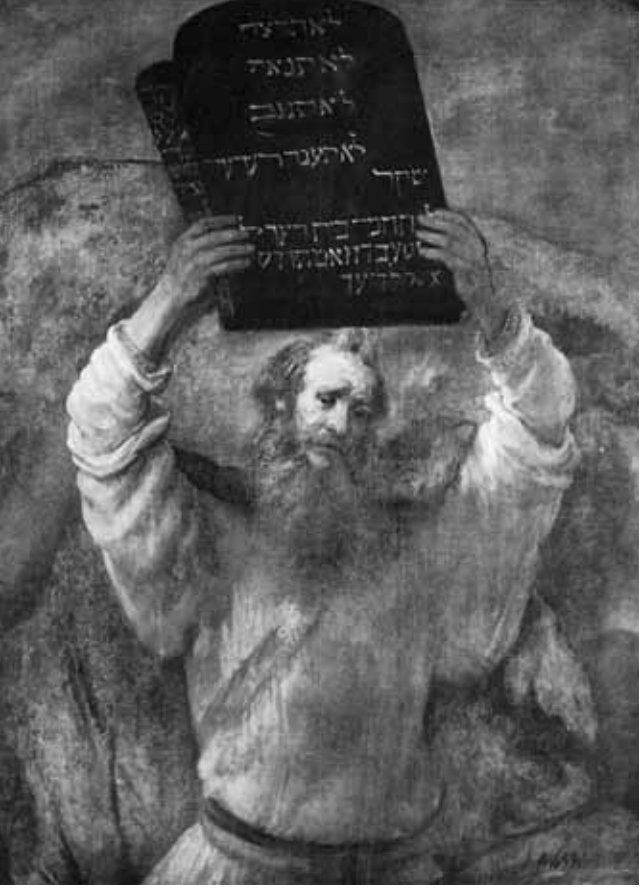
Figure 1. 'Natural law' is an apt metaphor provided we recognize that it is completely dependent on the biblical Lawgiver, and we don't press the analogy too far.

The first formulation details the conditions in which energy remains constant; it says nothing about whether there are any agents outside the isolated system that can create or destroy energy. It is a simple statement of inductive inference that has ontological limits, reflecting the inherent limits of experimental methodology. Both naturalism and theism can accommodate this formulation of the First Law of Thermodynamics. The First Law is consistent with an assumption that matter/energy has an eternal and necessary existence, which is foundational to many forms of naturalism. However, miracles in which energy is created or destroyed do not invalidate this formulation of the law because they are performed by beings that are not bound by the 'isolated system'. Therefore, the theist who believes that the universe is a created, contingent reality in which secondary physical causes operate can also affirm this