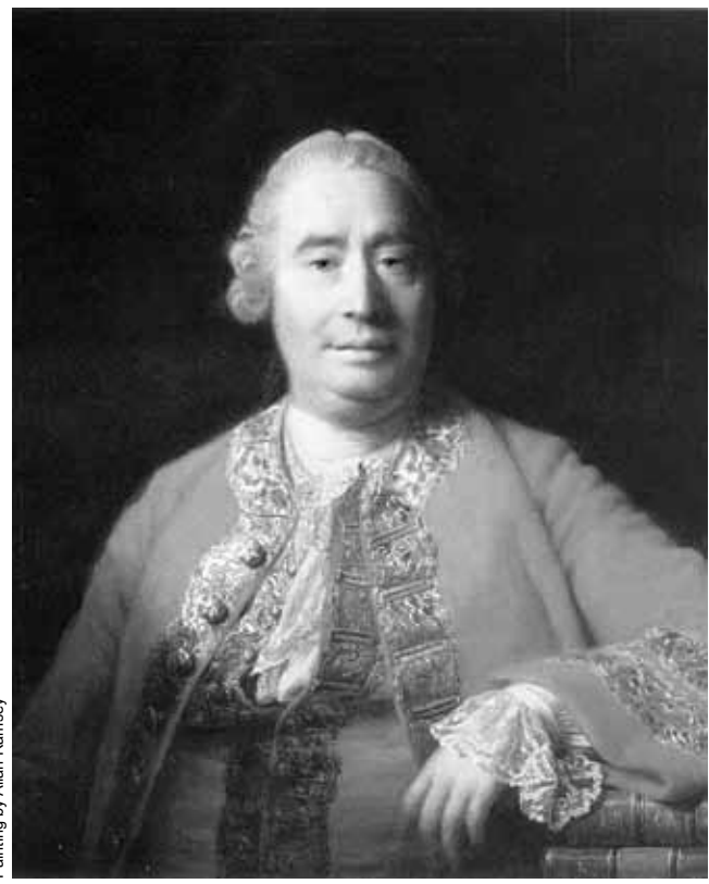
Figure 2. David Hume popularized an anachronistic definition of miracles as 'violations of the laws of nature' that continues to distort to this day.

All these ways of conceiving of miracles are beholden to Humean categories, which either exclude the possibility of miracles a priori or consider miracles a 'problem' of divine action to be solved. As a result, they make miracles sound like a problematic and/or incoherent concept that inevitably dissuade people from considering miracle claims. However, the only thing miracles are practically unanimously believed to demonstrate is that if one has ever occurred, then naturalism