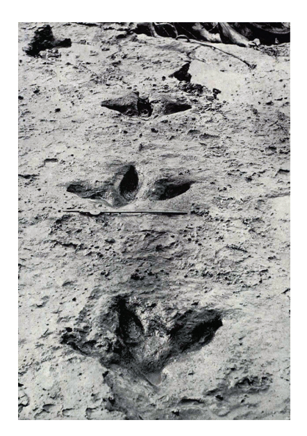
Figure 3. Moa ( Dinornis robustus ) tracks exposed in August 1911 in New Zealand.

Relatively large tridactyl (threetoed) tracks were discovered in the early Eocene Chuckanut Formation