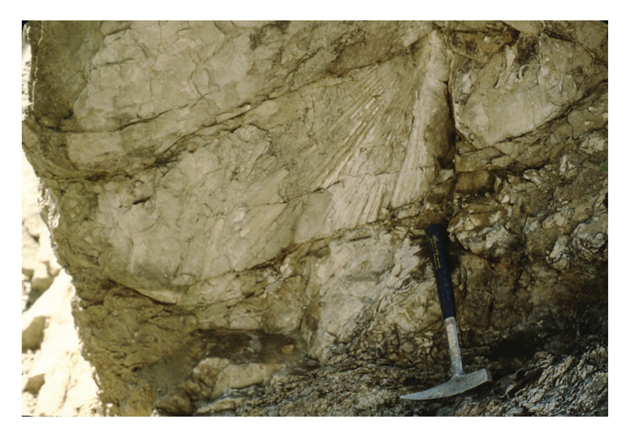
Figure 2. Palm fossil from the Chuckanut Formation northwest Washington.

The previous Late Triassic dates on fossil wood and basalt lava were explained away. It was also 'discovered' that the particular formation contains several 'thrust sheets', which conveniently would explain any anomalous dates in the formation. Thus, by a series of manipulations, these bird-like tracks from an unknown theropod dinosaur have now become real bird tracks, as they undoubtedly were all